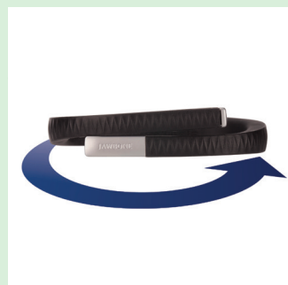
9. 360° Video