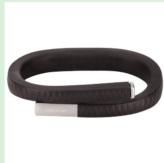
1. Main Image: Front/Top