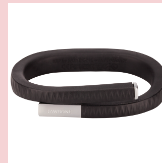
1. Main Image: Front/Top