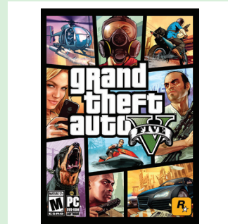
1. Front Artwork