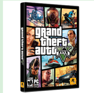
2. 45° of Case