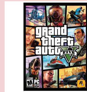
1. Front Artwork