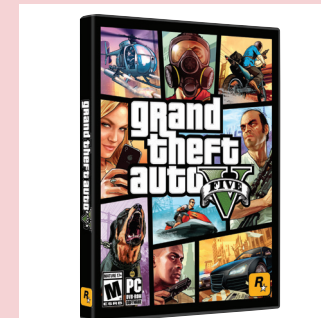
2. 45° of Case