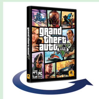
6. 360° Video