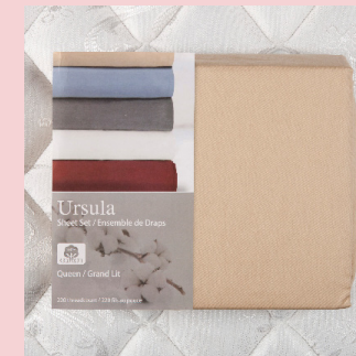
2. In Packaging