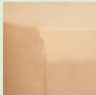
5. Close Up of Fitted Sheet