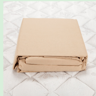
3. Out of Packaging