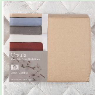
2. In Packaging