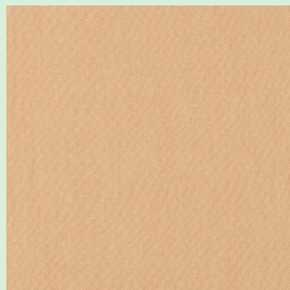
6. Close Up of Fabric