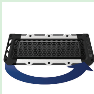
10. 360° Video