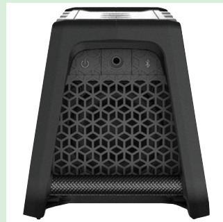
3. Side - Left Facing