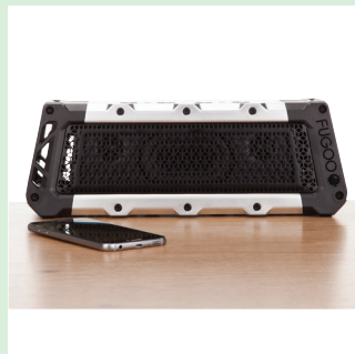
6. Size Reference