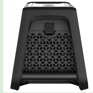
4. Side - Right Facing