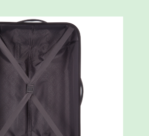
8. Interior right side