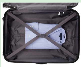
9. Interior top down with size reference