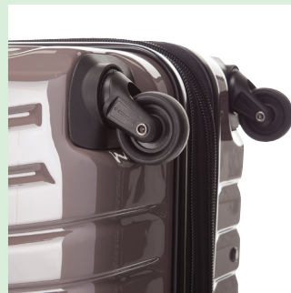
7. Close-up of wheels