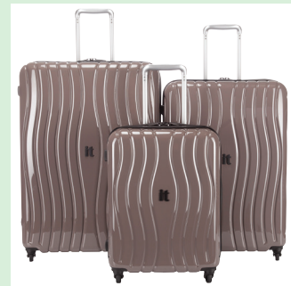
1. Front of full set