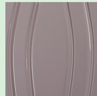
12. Close up