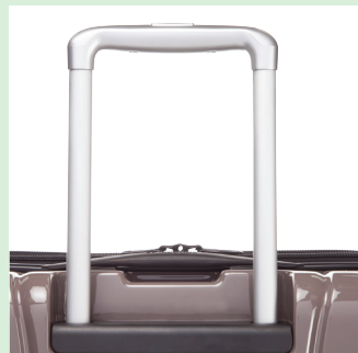
6. Close-up of handle