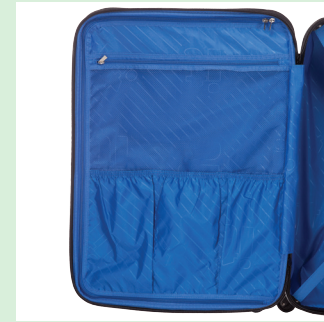
8. Left interior