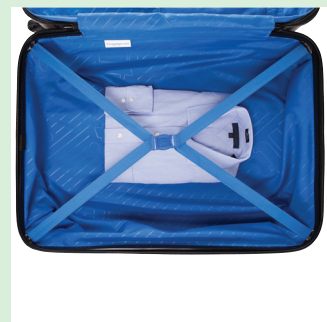
11. Top down medium interior with size reference