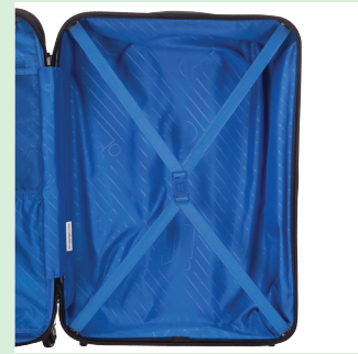
9. Right interior