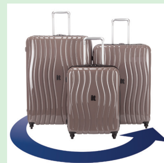
12. 360° Video