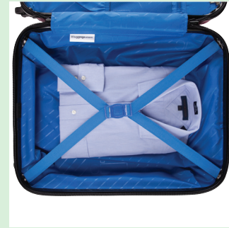
10. Top down small interior with size reference