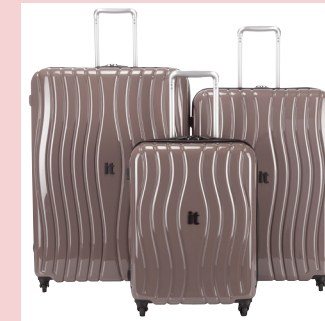
1. Front of full set