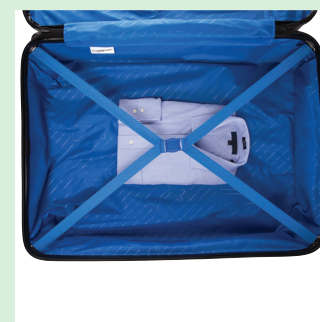
12. Top down large interior with size reference