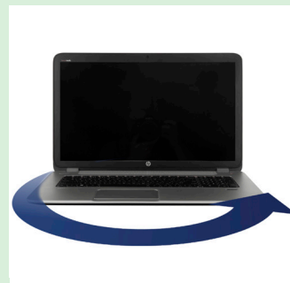
11. 360° video