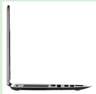
6. Side Right Facing