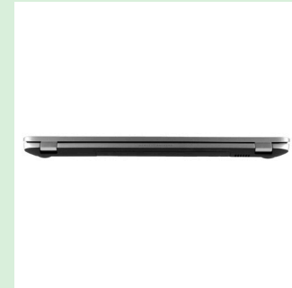
10. Back Closed