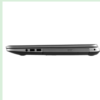
7. Side Left Facing Closed