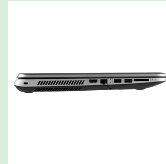
8. Side Right Facing Closed