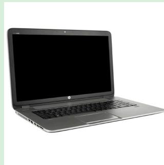
2. 45° right Facing