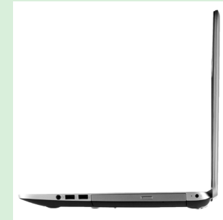
5. Side Left Facing