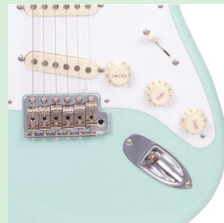
7. Close up of feature