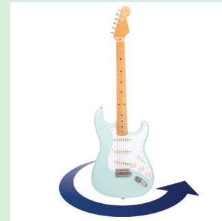
8. 360° Video