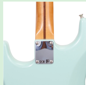
6. Close up of neck/body connection