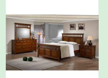
I. Main Image: Lifestyle