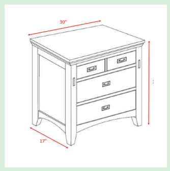
8. CAD or Line Drawing