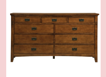
2. Front of Piece I