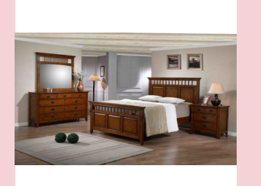
I. Main Image: Lifestyle