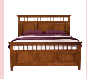
4. Front of Piece 3