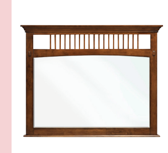
5. Front of Piece 4