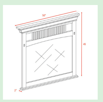
10. CAD or Line Drawing