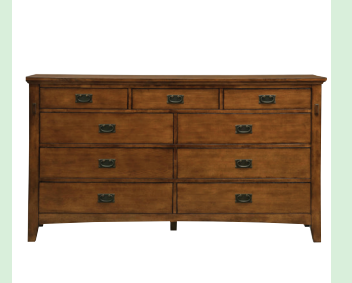
2. Front of Piece I