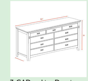
7. CAD or Line Drawing