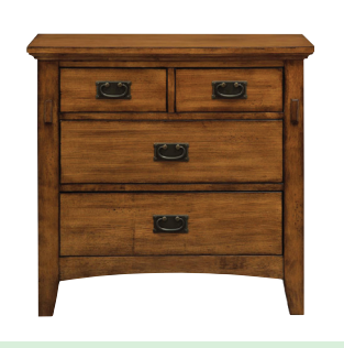
3. Front of Piece 2