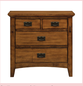
3. Front of Piece 2