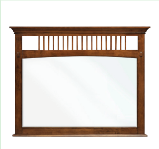
5. Front of Piece 4