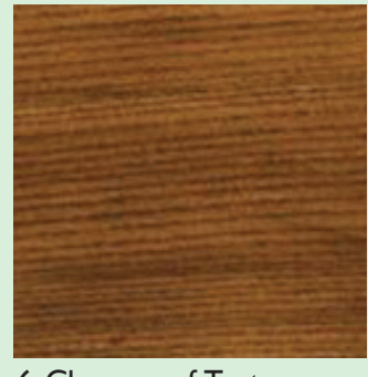
6. Close-up of Texture