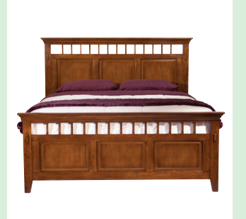
4. Front of Piece 3