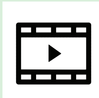
4. Technology or feature based video, appliance line up