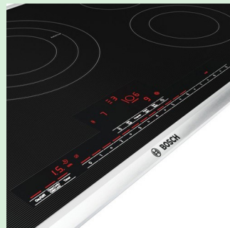
2. Close Up