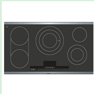
1. Top Down