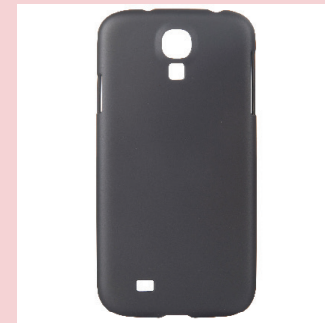
1. Front (case exterior)