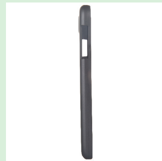
4. Right profile view