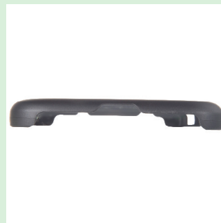
6. Bottom profile view