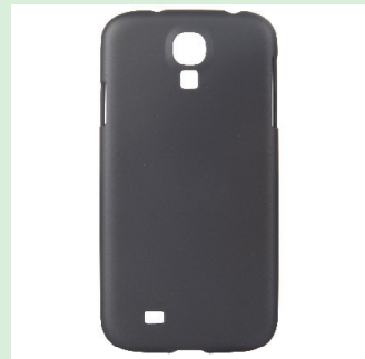
1. Front (case exterior)