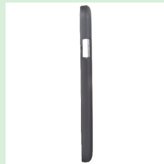
3. Left profile view