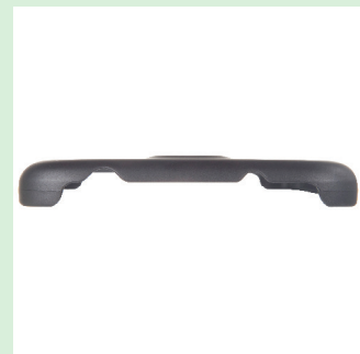
5. Top profile view