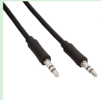
1. Cable ends