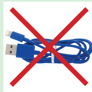
Do not bundle cables