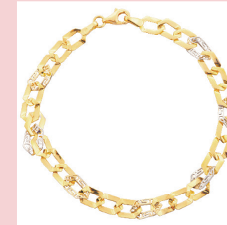
1. Top Down