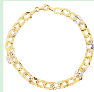
1. Top Down