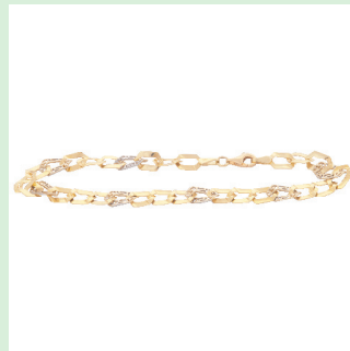
2. Front Facing (if applicable)