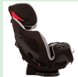
5. Side Right Facing