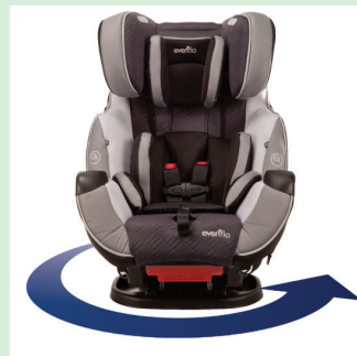
11. 360° Video