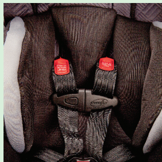
6. Close Up