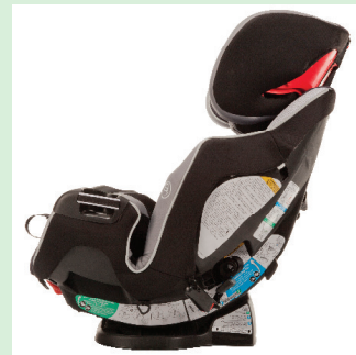
3. Side Left Facing